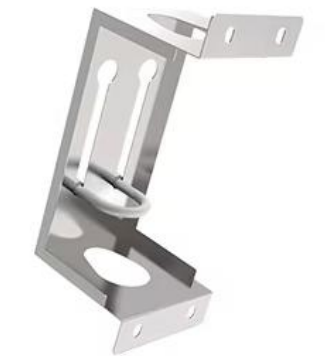
Fixed support, can be used with pipes