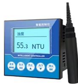
Portable control box, real-time online LCD display data